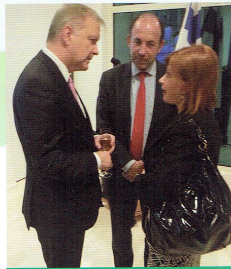
AER President and Secretary General met with Olli Rehn, EC Commissioner for Economic and Monetary Affairs and the Eurozone.

This is the dawn of a new year, which I hope will witness the strengthening of our regional Assembly. I hereby promise that the AER will implement new and innovating activities throughout 2014.